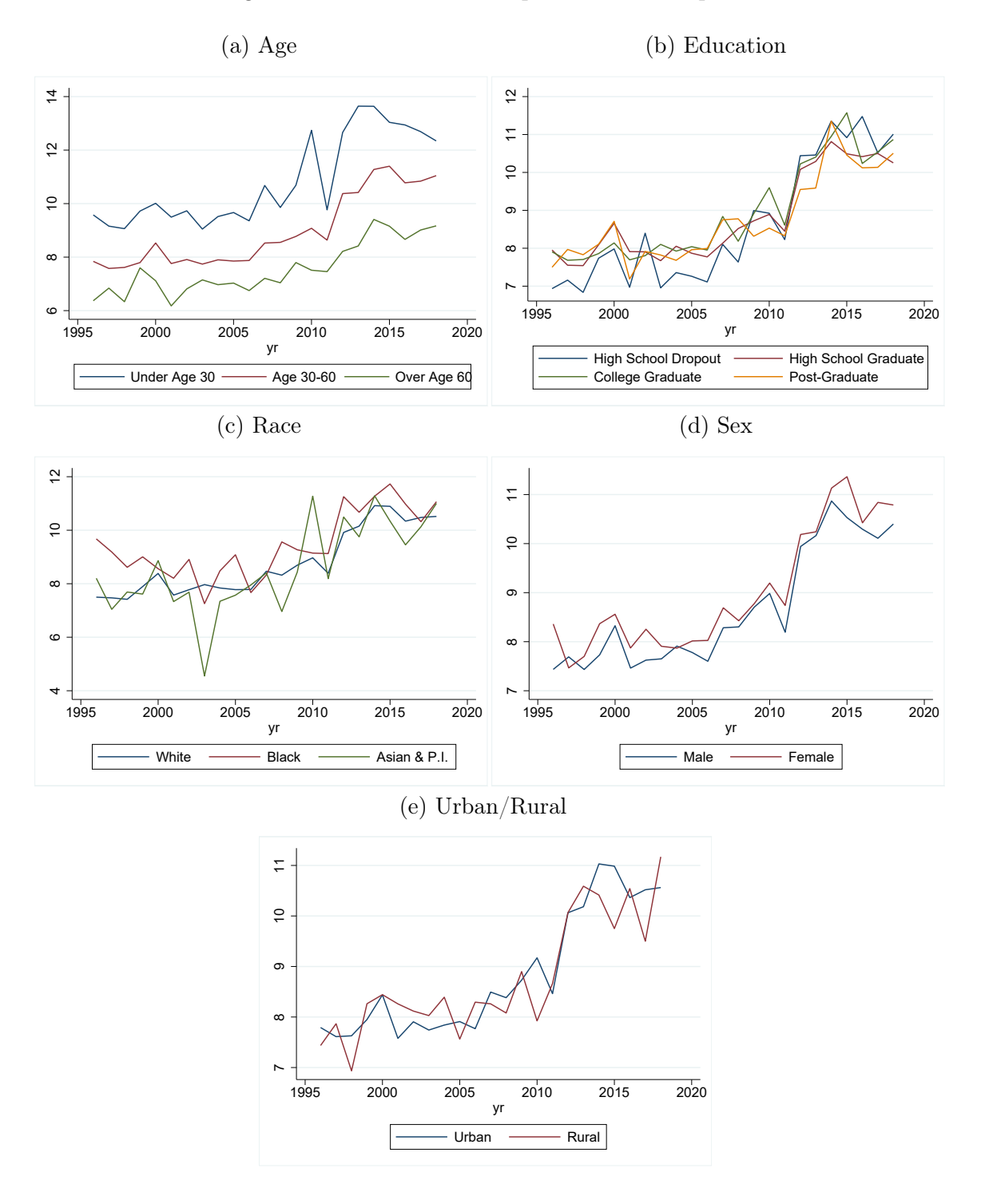
Figure 1: Share of Total Expenditure on Imports